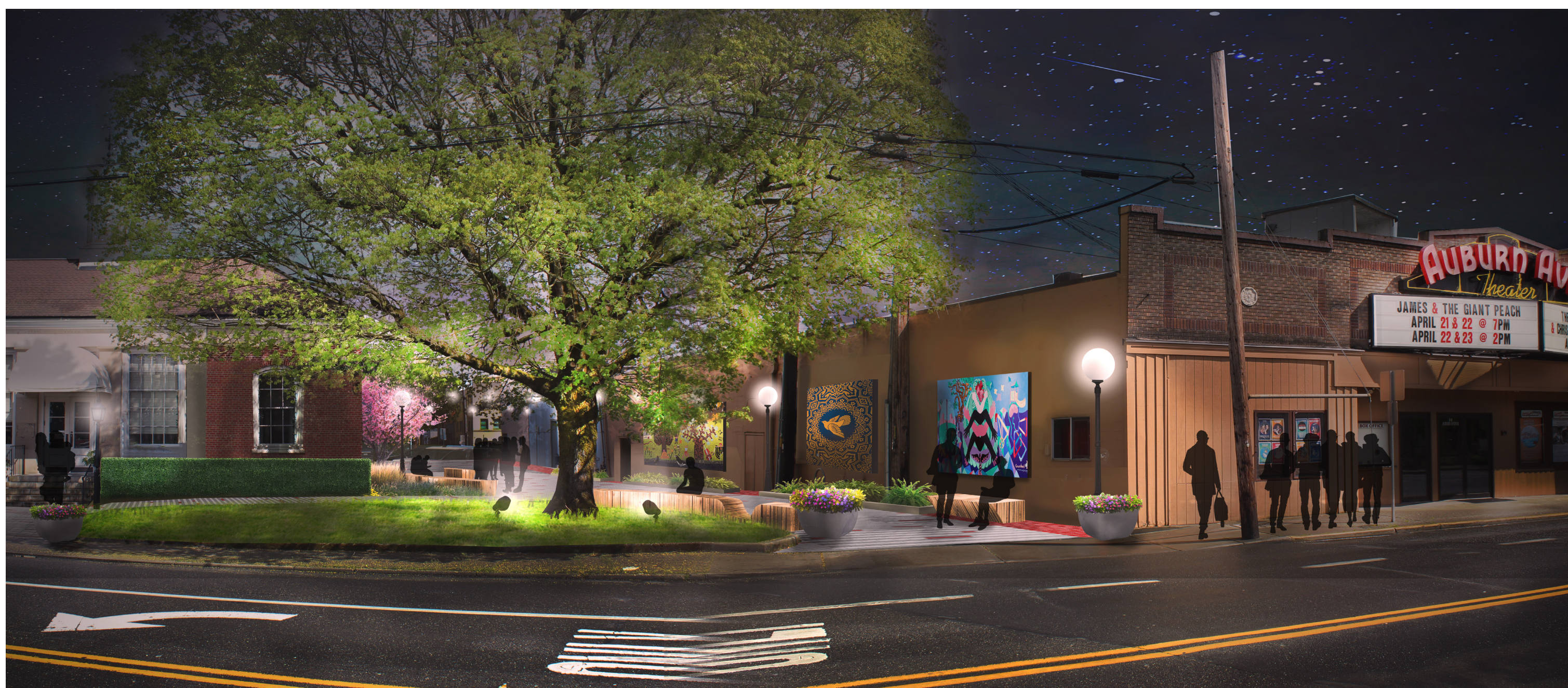
Rendering of the Proposed Alley Design. Credit: Allison Ong