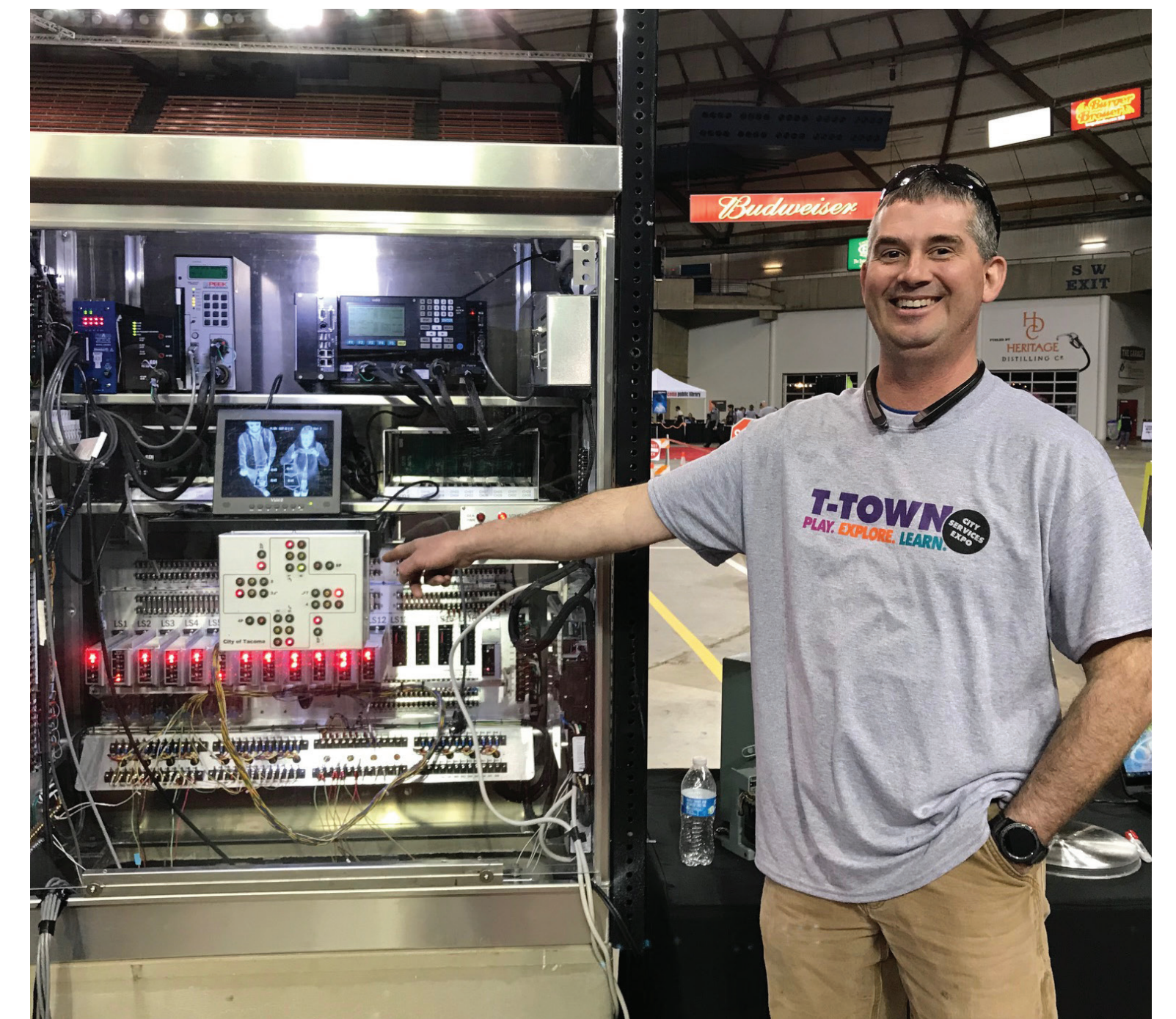
A City employee at T-Town, one example of civic engagement efforts at the City of Tacoma.

The Roadmap to Civic Engagement project was conducted by the first cohort of students in the Community Planning graduate program at the University of Washington Tacoma. This project was identified as a priority by the City Manager's Office to yield an internal inventory of civic engagement practices at the City of Tacoma. The project stems from the Equity recommendations made in Tacoma 2025, which was created with the participation and input of over 2,000 residents. Generated from qualitative data directly from the City of Tacoma staff, students produced a report package of key findings, opportunities for investment, and a roadmap evaluation tool.