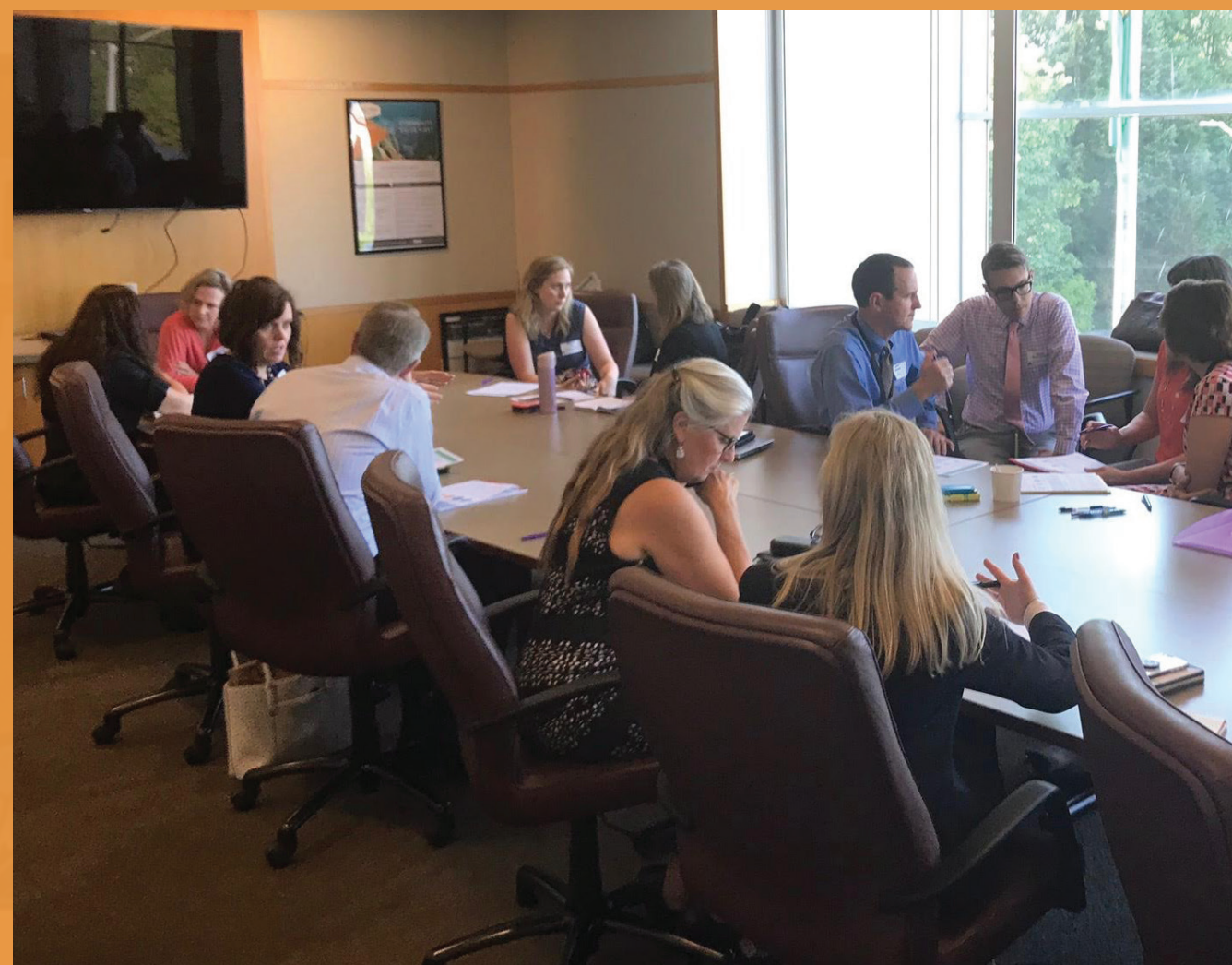
Students held two meetings with City staff to further refine initial findings.