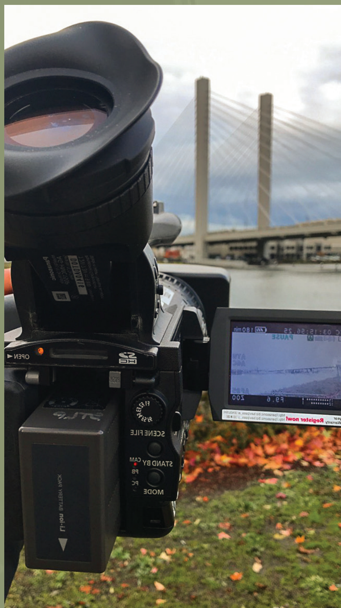
Students visited Tacoma throughout the process to collect footage.

The final video focused on mixed-use centers , a type of development that is often seen as a threat in communities. The video team first explained the concept of a mixed-use development. They then clarified the ways in which this density-driven building approach can encourage equitable development of affordable housing, local businesses, and public transportation. The team ended by highlighting development along Pacific Avenue that serves as an example of how mixed-use centers can be respectfully integrated into community.