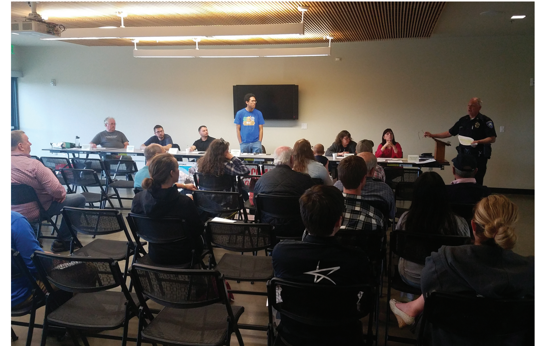
A Tacoma Police liaison takes questions and addresses recent concerns of the South Tacoma residents.

In 1992, The Tacoma City Council established the Neighborhood Council Program to promote citizen engagement with local government. In our project, we examined the development of the program since the last five-year review. In particular, we focused on how well the program operates with regard to bi-directional representation: how effectively the neighborhood councils represent their stakeholders, as well as how responsive the city is to the neighborhood council as the representatives of their communities. We also offer recommendations to the City and Neighborhood Councils to identify potential areas of opportunity.