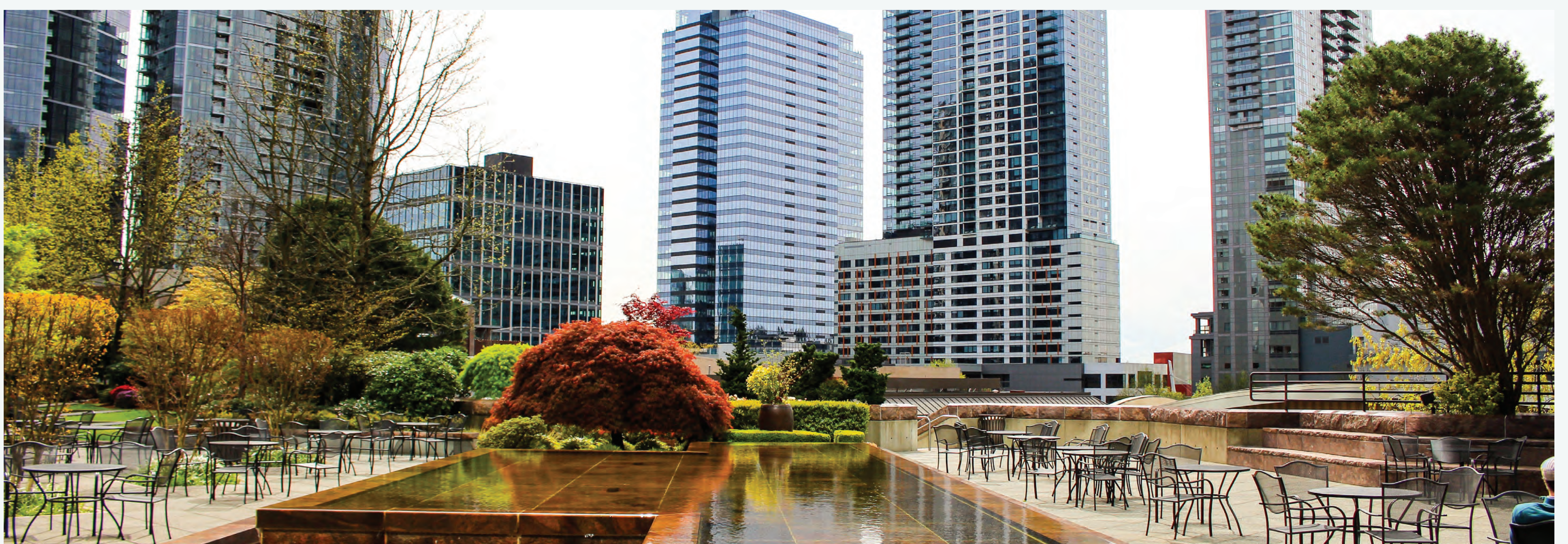
The students selected Symetra Plaza in downtown Bellevue as an example of a successful open space to be included in the design review image catalogue. LCY STUDENT TEAM

Our design review catalogue takes the form of a Flickr site and contains within it twelve location examples which relate to the categories of 1) open space, 2) through-block pedestrian connections, and 3) alleys with addresses. For each location, we include photos, a written assessment, a link to a map, and any relevant downtown land use codes. This tool may serve as a reference guide for City of Bellevue employees and may also assist contractors looking to submit design proposals that align with the City's goals and vision. Based on a literature review we conducted,