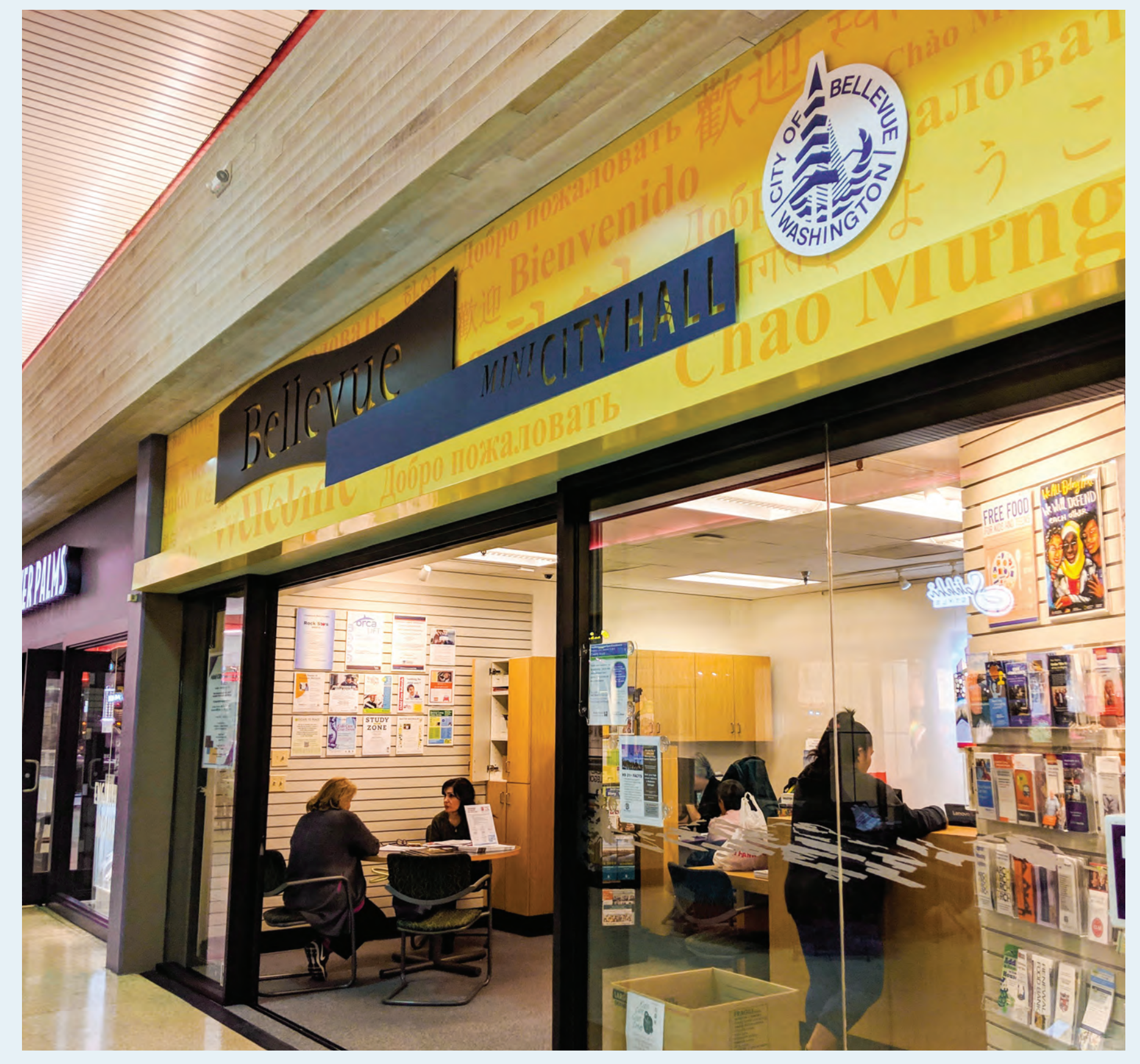
The current Mini City Hall opperates at the Crossroads Mall in East Bellevue. LCY STUDENT TEAM