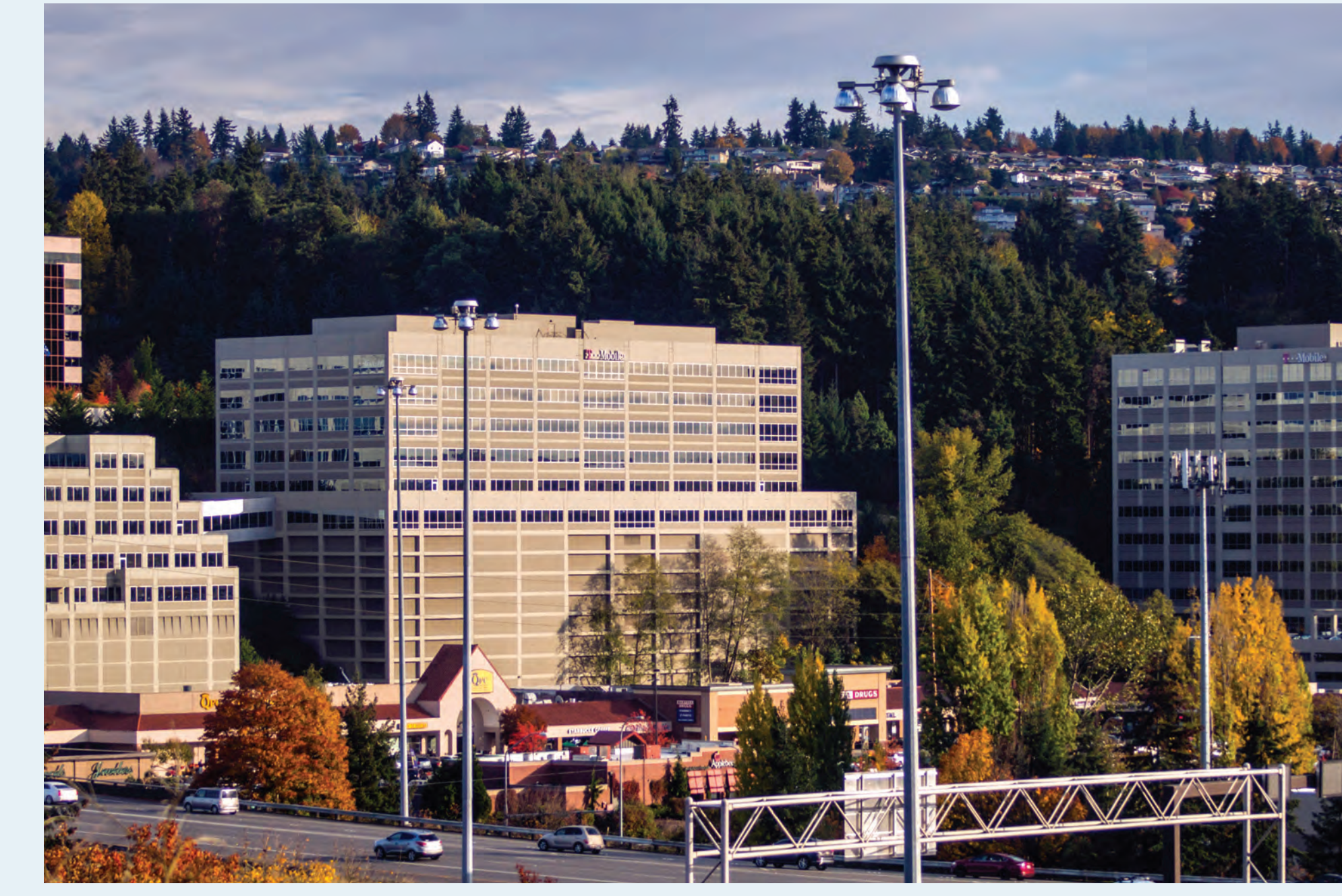
The Factoria Mall has vacant storefronts and is easily assessable by all modes of transportation.