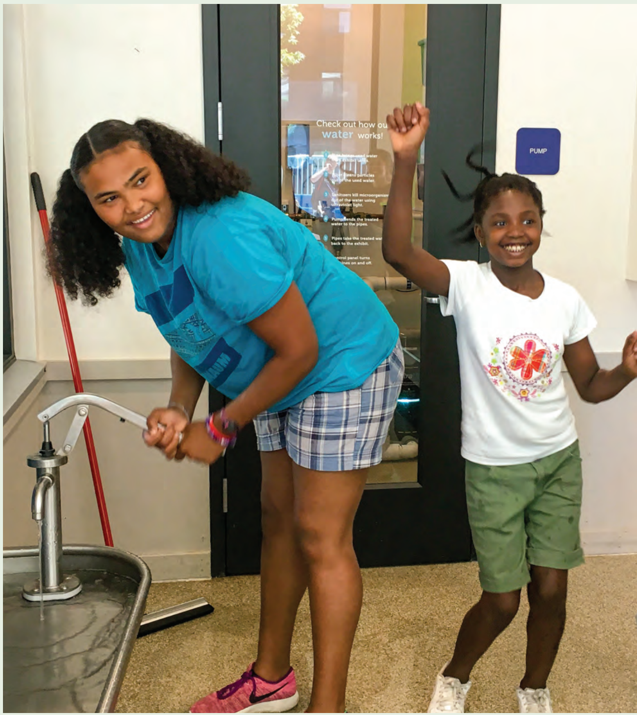
Bellevue's Parks & Community Services offers educational recreation programs for people of all ages and abilities. CITY OF BELLEVUE