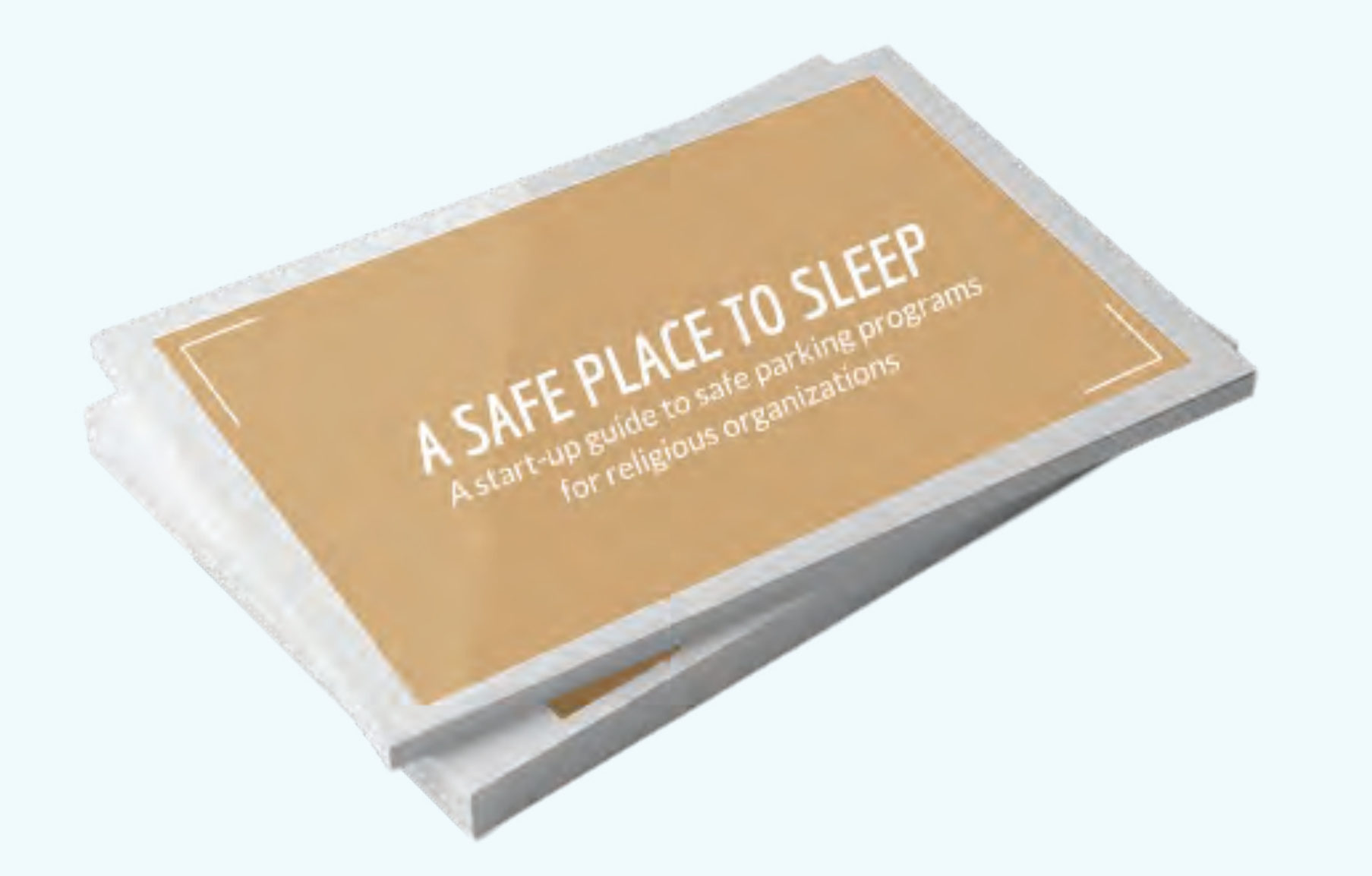
Safe Parking Start-Up Guide booklet VICTORIA PINHEIRO

The City of Bellevue will use this information to gain buy-in from local religious organizations and empower them to create their own programs to serve people experiencing homelessness in Bellevue.