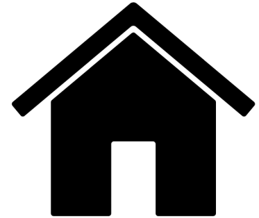
Community Open House