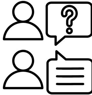
Focus Groups and Interviews